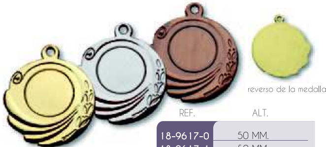
reverso de la medalla