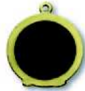
reverso de la medalla