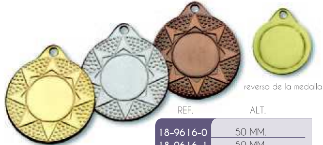
reverso de la medalla