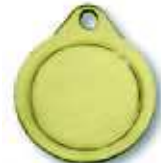
reverso de la medalla