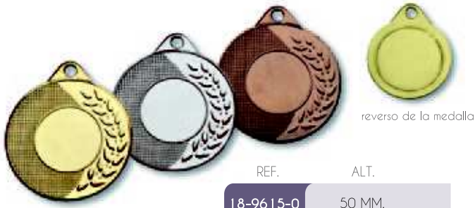
reverso de la medalla