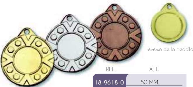
reverso de la medalla