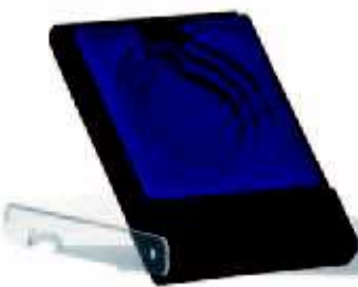
para Ø 50-60-70 mm.